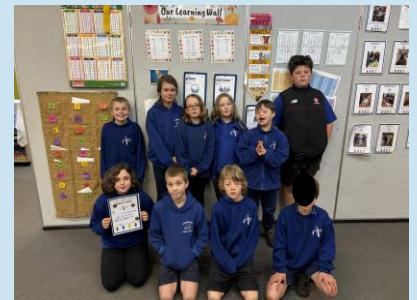
Students of the Week