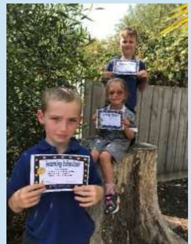
Students of the Week