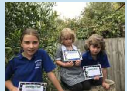
Students of the Week