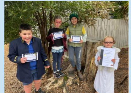
Students of the Week – Week 7