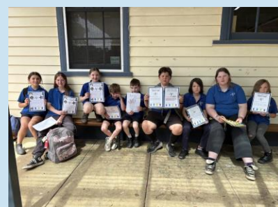
Student of the Week Awards