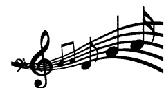
Grad dip Mus