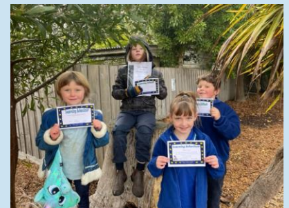
Students of the Week